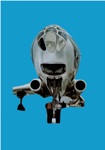
100 FROM THE SERIES Less, 2008 29.5 x 21 cm