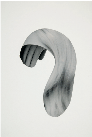
146 FROM THE SERIES Less, 2013 48 x 33 cm