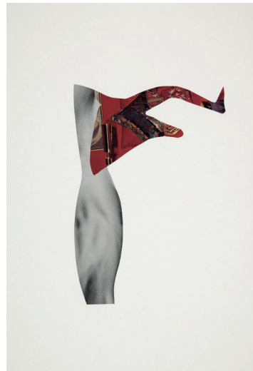
FROM THE SERIES Less, 2013 48 x 33 cm 147